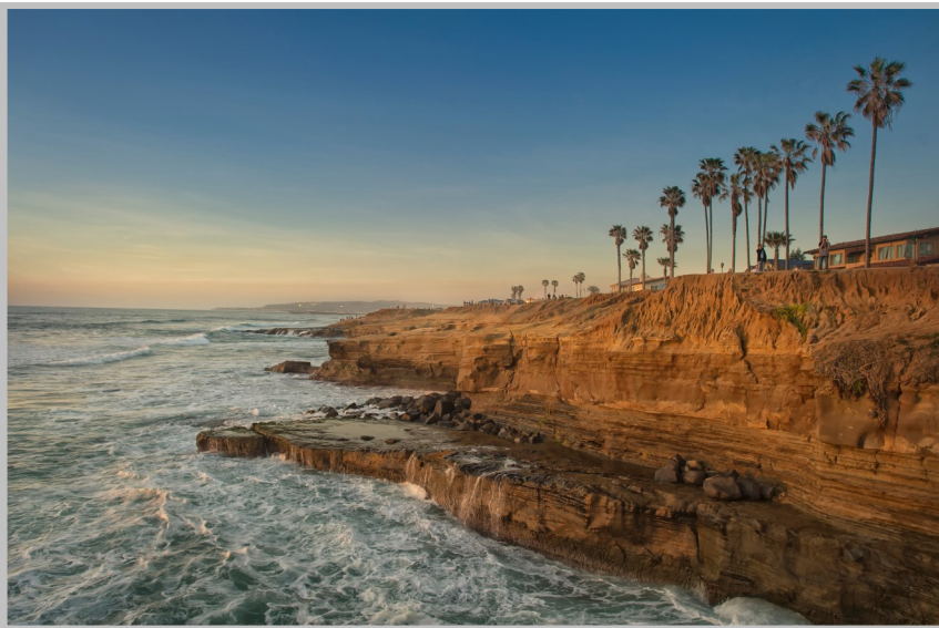
Sunset Cliffs Ocean Beach