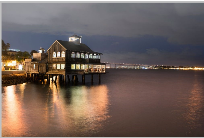
SeaPort Village San Diego