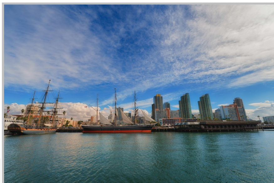
Star of India San Diego Maritime Museum