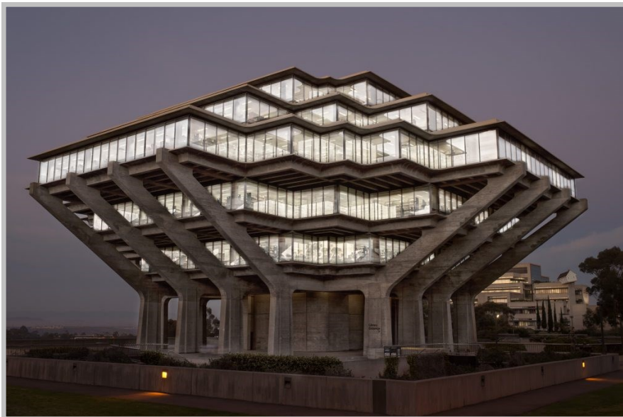
Geisel Library (UCSD )