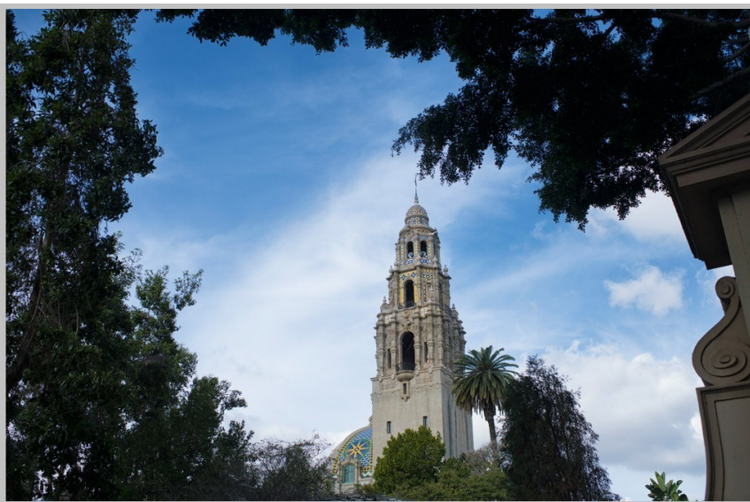
Balboa Park San Diego