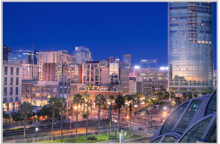
Gas Lamp District from Convention Center