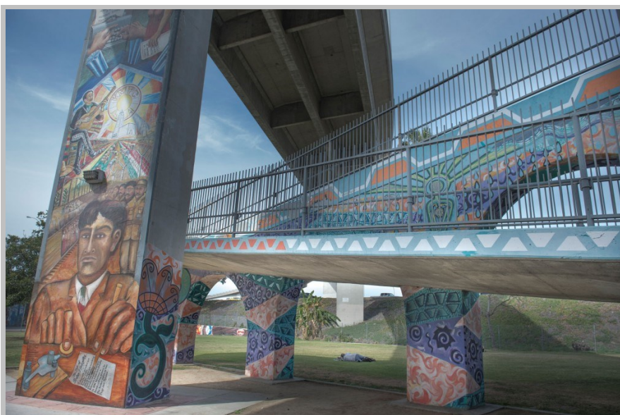
Chicano Park Logan Heights San Diego