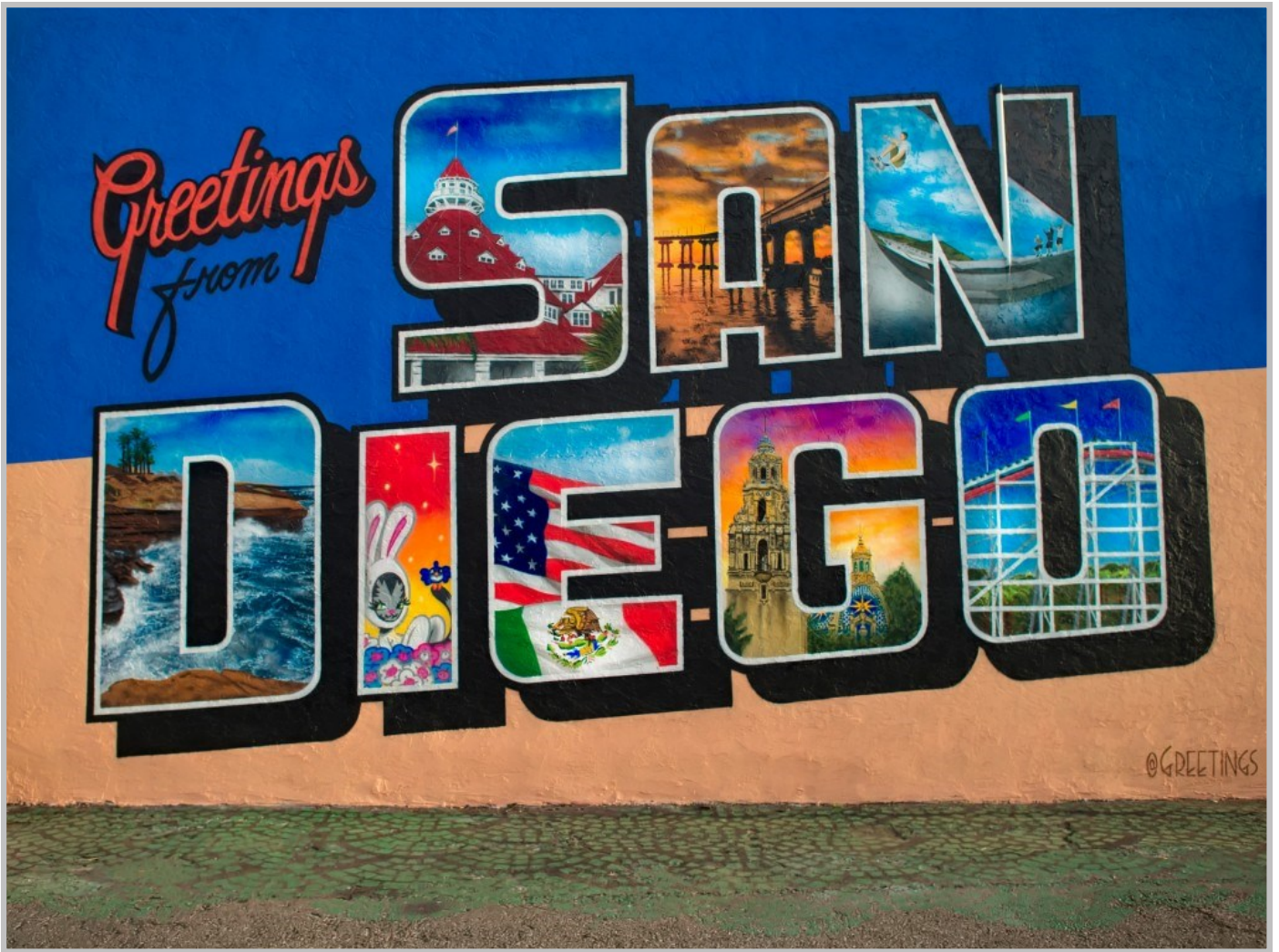
Mural located at 30th and El Cajon Blvd in North Park San Diego