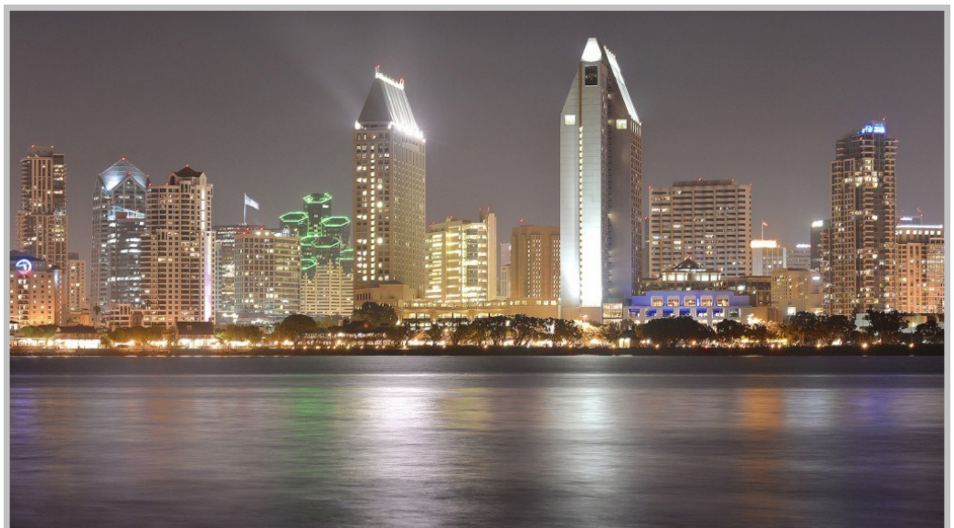
San Diego from Centennial Park Coronado