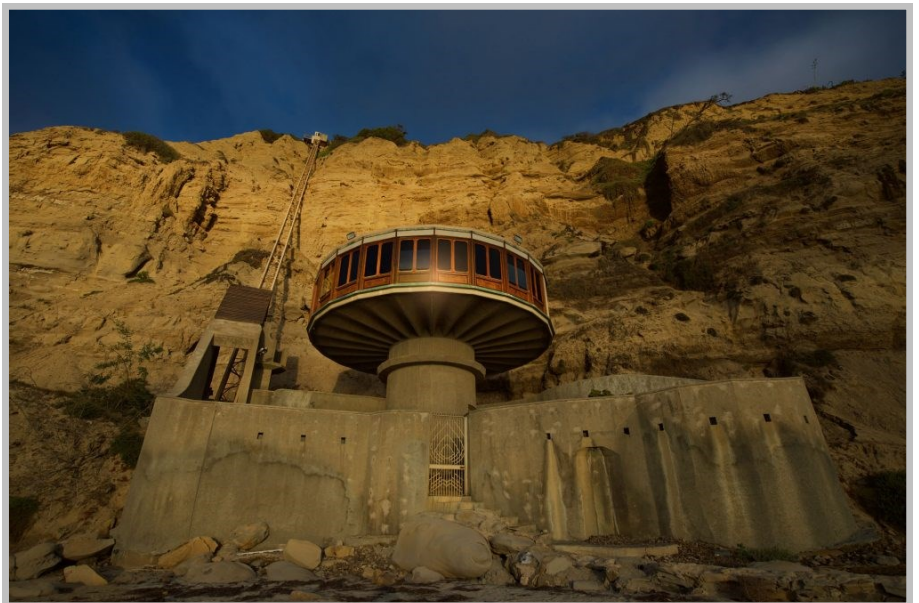
The Mushroom House La Jolla (near Estancia La Jolla)