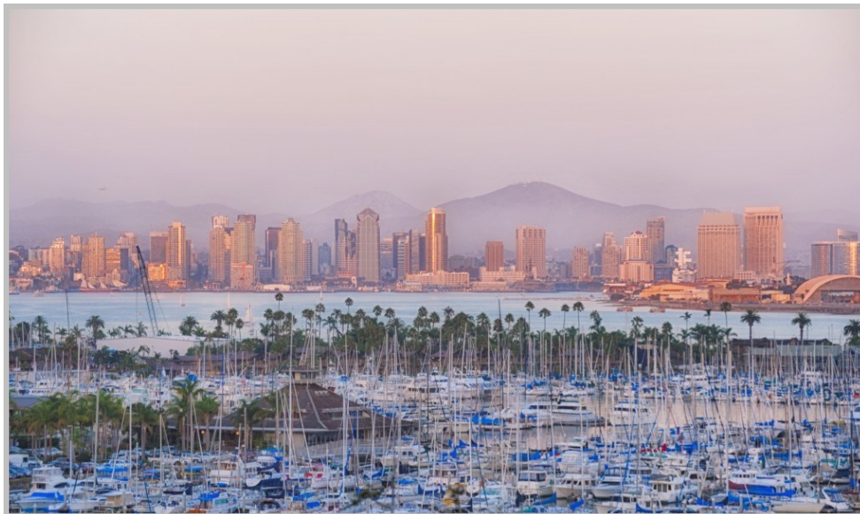
San Diego Skyline from Point Loma