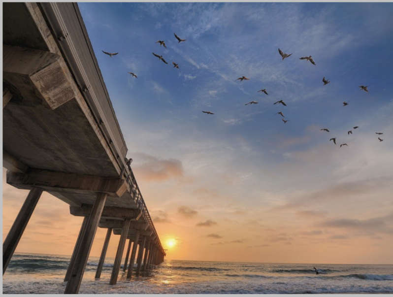
Scripps Pier La Jolla