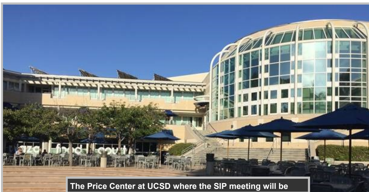
The Price Center at UCSD where the SIP meeting will be