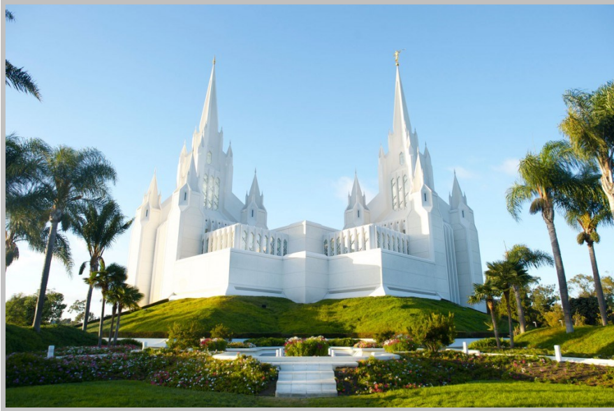
The Church of Jesus Christ of Latter Day Saints La Jolla