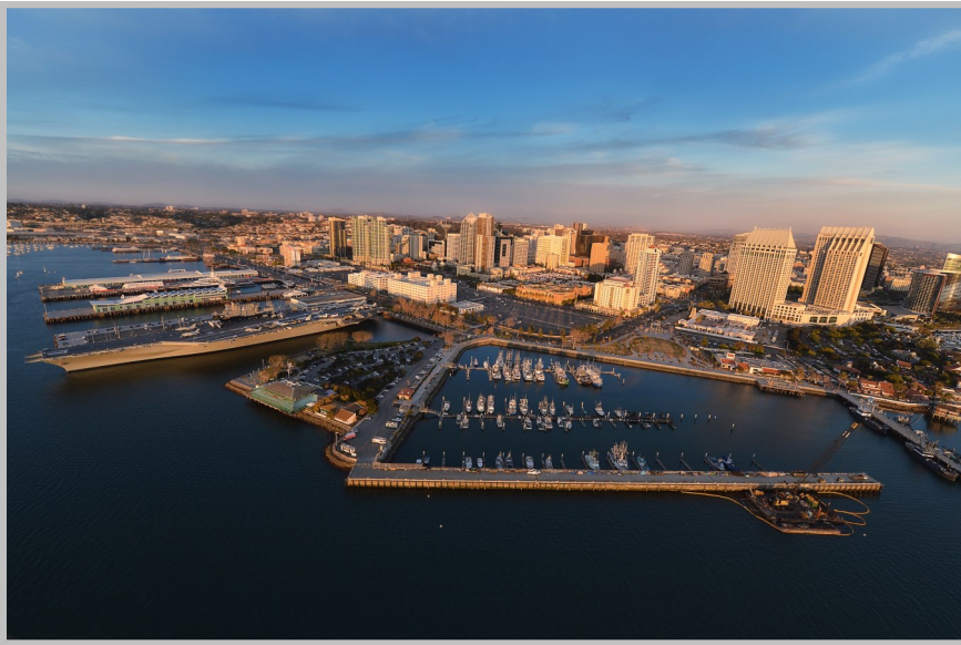
Downtown San Diego aerial view